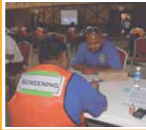
Above: Screening for SNS medicine

The purpose of the exercise was to measure and validate responders' performance in carrying out critical tasks pertaining to resource management and operation during a pandemic event. This exercise provided the opportunity to strengthen interagency partnership, train in disaster planning, and execute response mechanisms. Particular emphasis was on how to use and manage the Strategic National Stockpile (SNS) focusing on coordination and control; managing SNS Operations; and providing mass dispensing of the medical materiel.