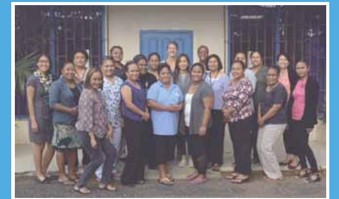
Above: ASTHO and MOH partners

Launched in September 2011, the initiative brings together public and private partners to enhance cardiovascular disease prevention activities and improve care by encouraging a target focus on the "ABCS": Aspirin for people at risk, Blood pressure control, Cholesterol management, and Smoking or tobacco cessation. For the Million Hearts project, the Palau MOH team will be analyzing how relevant hypertension data can be incorporated into its current NCD registry to inform effective disease management, how data on tobacco use can be captured to assist referral to quit programs, and how to leverage other public health clinics to screen for hypertension. Palau aims to increase the number of patients with controlled blood pressures.