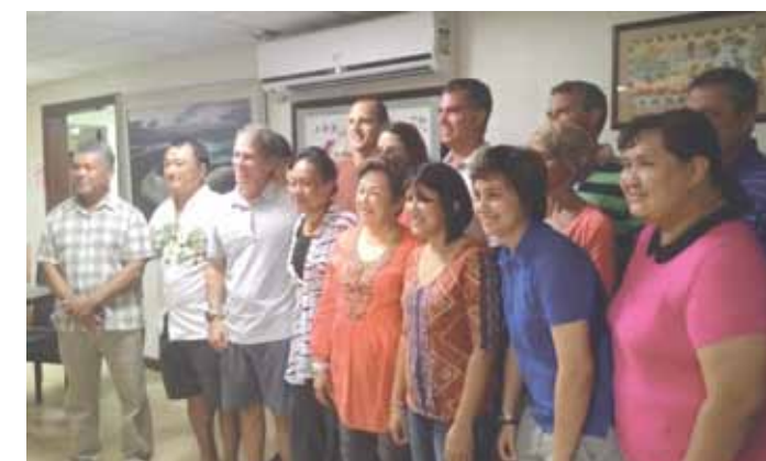
pictured above: SDA medical team at the Belau National Hospital